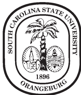
The SC State Official Seal

When written permission to use the seal is granted by the SC State Office of Marketing and University Relations, the seal should be reproduced to a size that the text "SCIENTIA OFFICUM HONOS" is clearly legible. At its discretion, the Office of University Relations and Marketing may review the use of the seal after permission has been extended to determine whether or not it is being used correctly. If usage is deemed incorrect or not to acceptable standard, the SC State Office of University Relations and Marketing may revoke permission to use the seal.